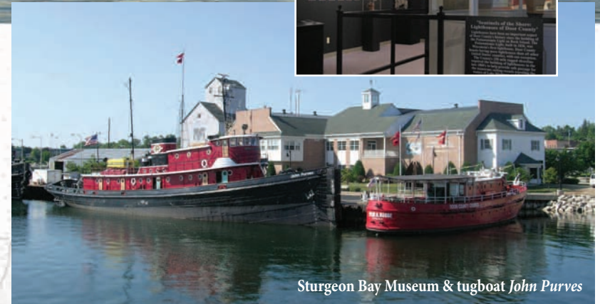
Sturgeon Bay Museum & tugboat John Purves