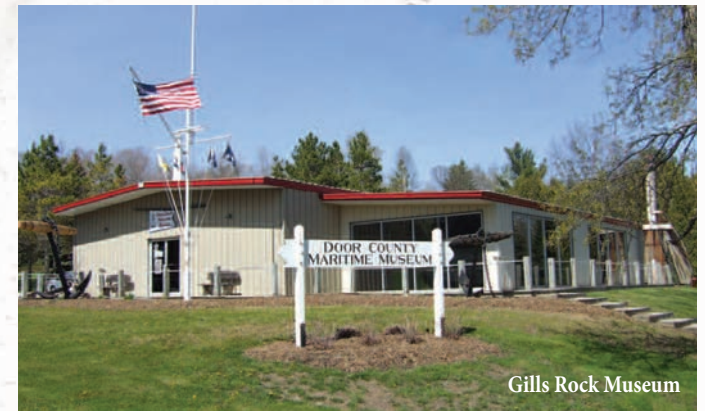
Gills Rock Museum

Located at 12724 Wisconsin Bay Road in Gills Rock.